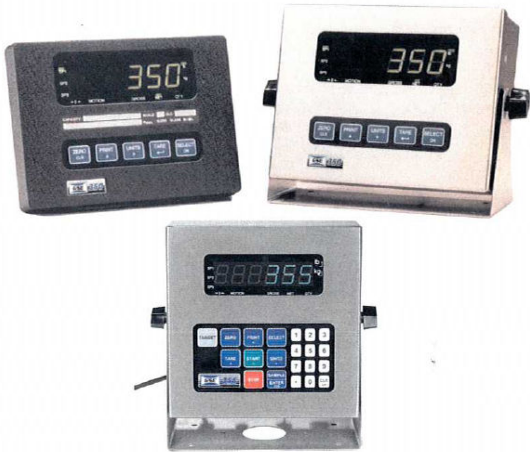
Figure 1 GSE 350-Series controllers