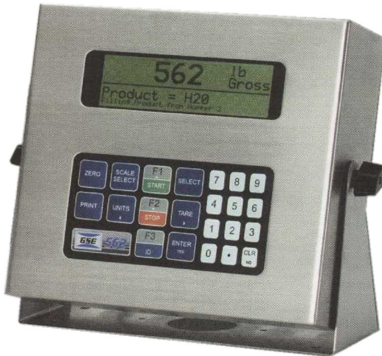
Figure 2 Typical GSE 60-Series front panel (562 Model)