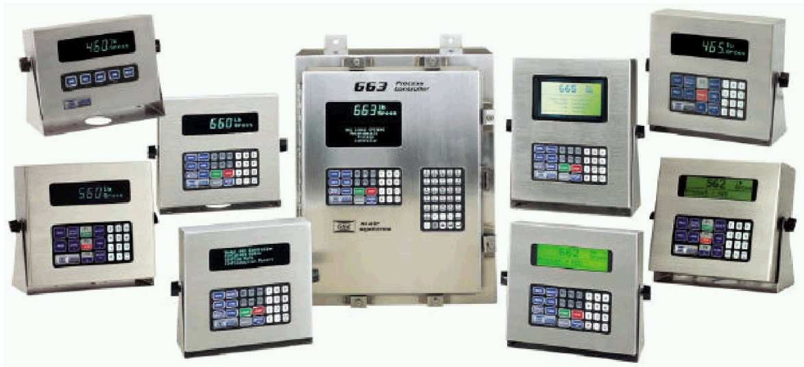
Figure 1 GSE 60-Series controllers